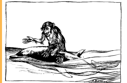
(Illustration by Arthur Rackham)

A Sailor, bound on a long voyage, took with him a Monkey to amuse him while on shipboard. As he sailed off the coast of Greece, a violent tempest arose in which the ship was wrecked and he, his Monkey, and all the crew were obliged to swim for their lives. A Dolphin saw the Monkey contending with the waves, and supposing him to be a man (whom he is always said to befriend), came and placed himself under him, to convey him on his back in safety to the shore. When the Dolphin arrived with his burden in sight of land not far from Athens, he asked the Monkey if he were an Athenian. The latter replied that he was, and that he was descended from one of the most noble families in that city. The Dolphin then inquired if he knew the Piraeus (the famous harbour of Athens). Supposing that a man was meant, the Monkey answered that he knew him very well and that he was an intimate friend. The Dolphin, indignant at these falsehoods, dipped the Monkey under the water and drowned him.