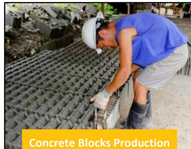
Concrete Blocks Production