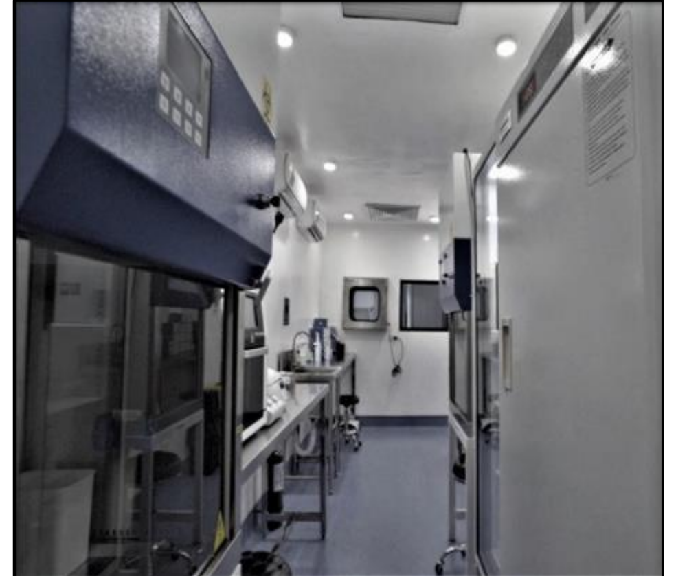
IN-HOUSE RT-PCR TESTING LABORATORY