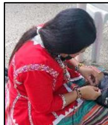
MANSAKA TRIBAL COMMUNITY CELEBRATION