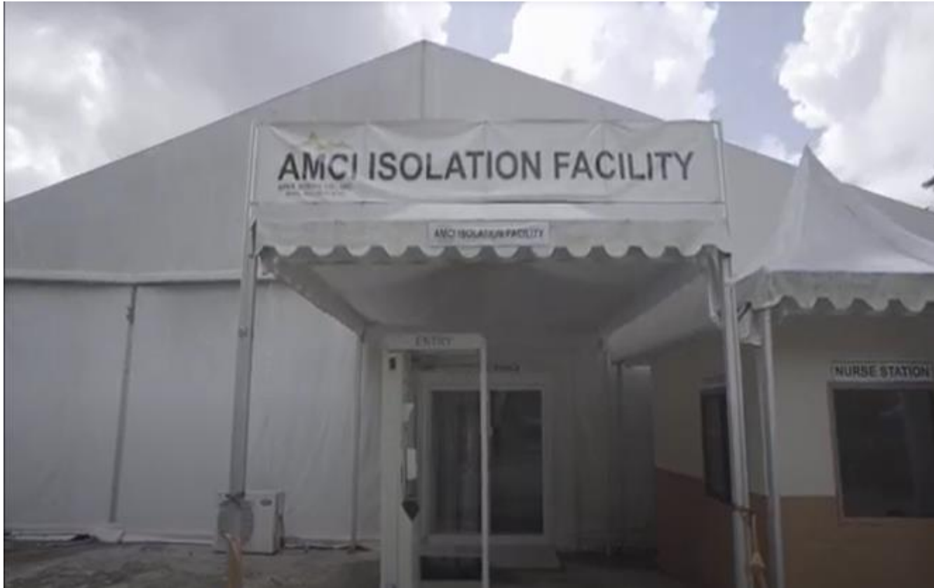
50 BED ISOLATION FACILITY