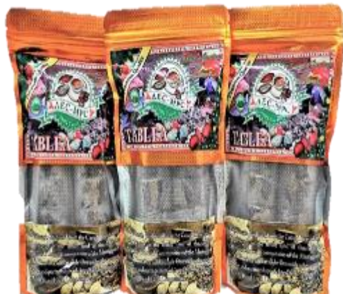
Dark Chocolates Products