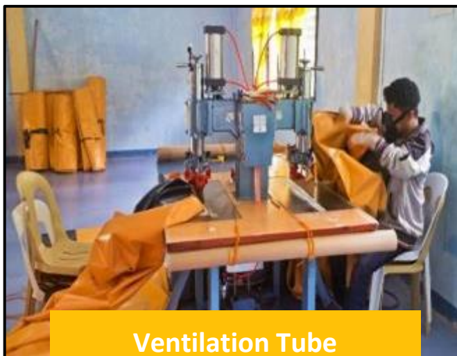
Ventilation Tube Production